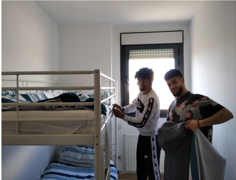
One of our opportunity homes in Spain.