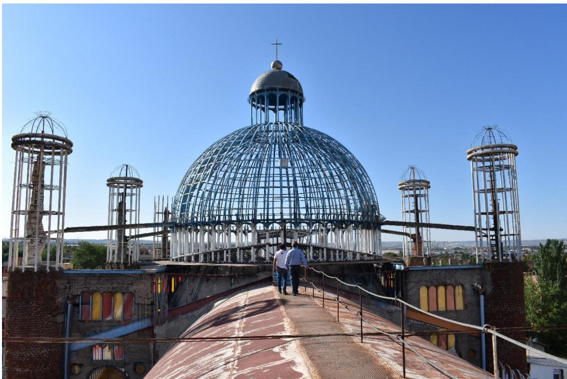
View of Justo's Cathedral in Mejorada del Campo.