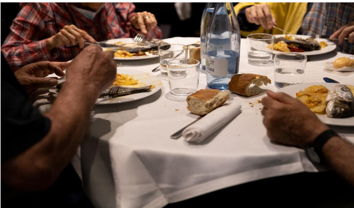
Robin Hood Solidarity Restaurant