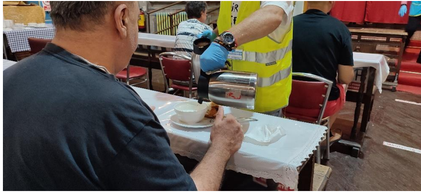
Breakfast delivery (Madrid, España).