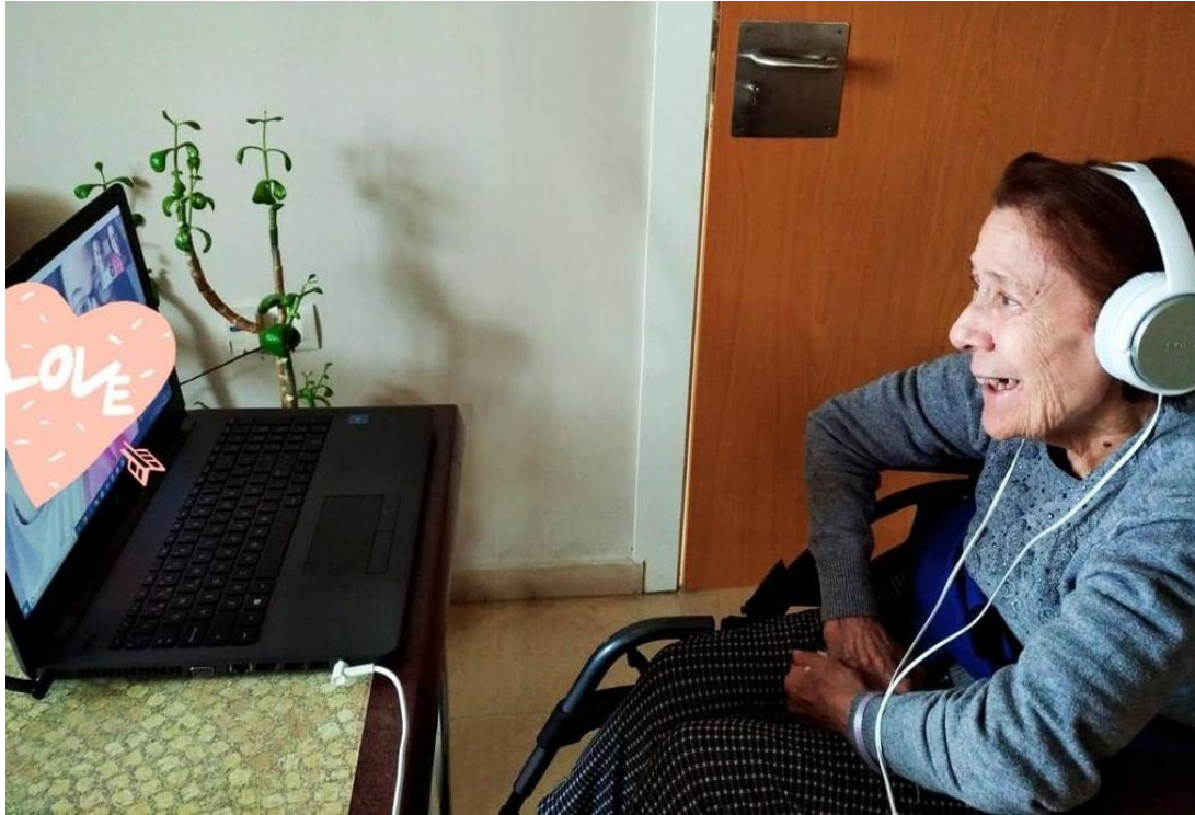
Supply of a videocall system in the 14 residences managed by MdP Extremadura.