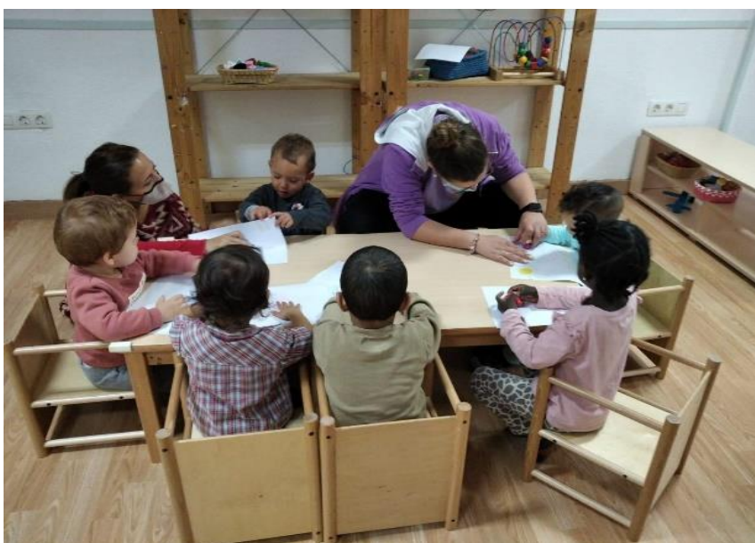
Socio-educational family and childhood center 'La Casita'.