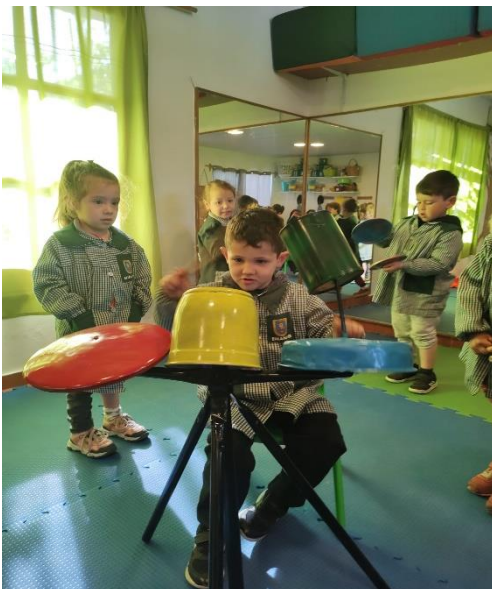
One of the Early Childhood Centers in Uruguay.