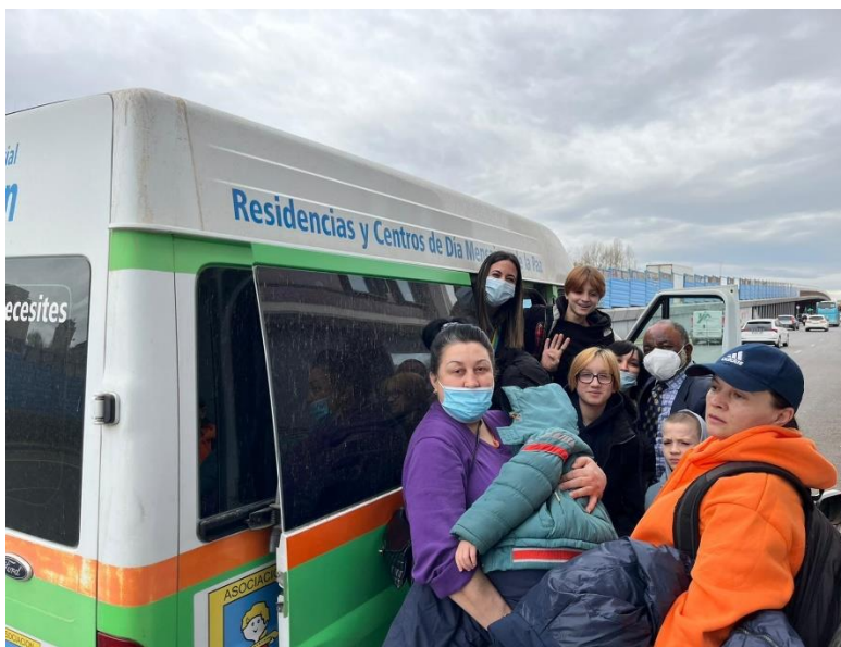
Arrival of Ukrainian refugees to Spain.