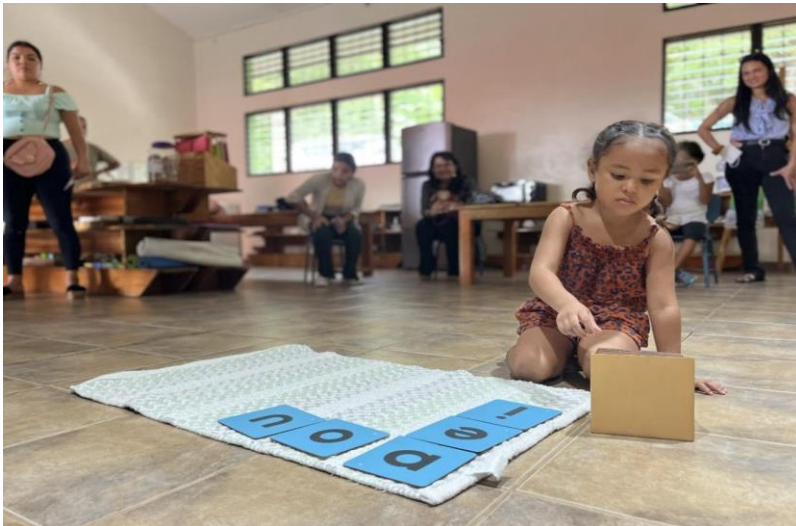
Socio-educational community center in Honduras.