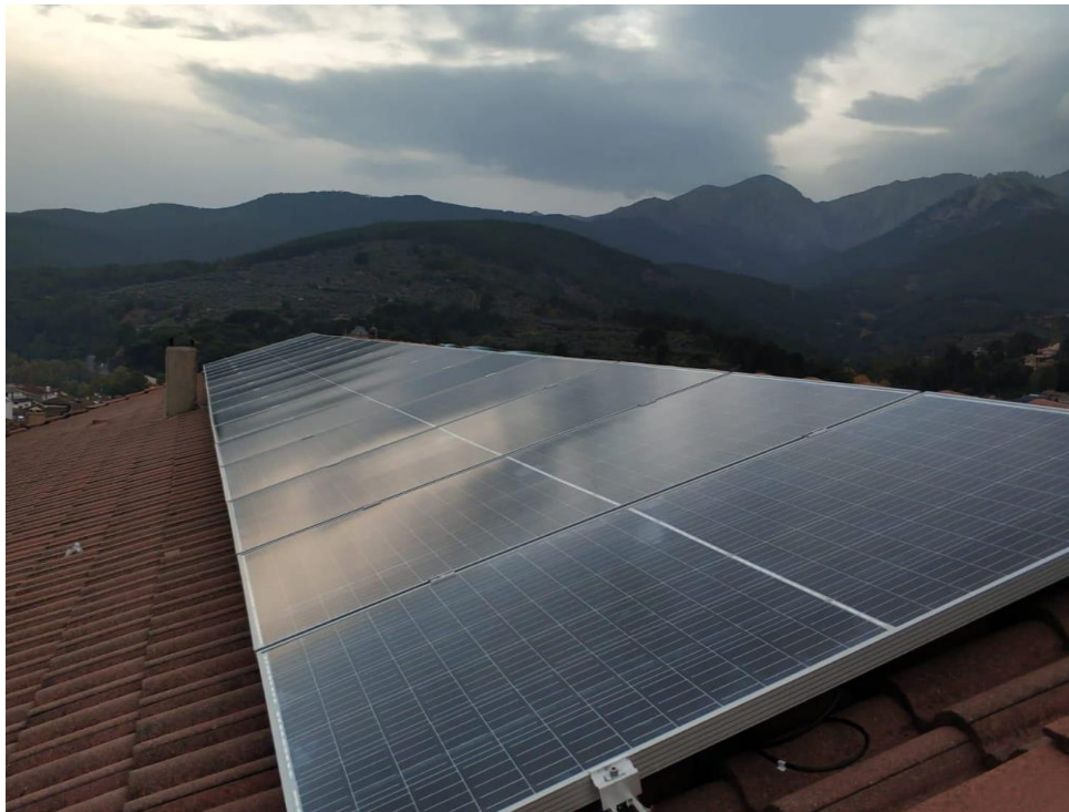
Solar panels in one of our residences (Residencia Don Bosco, Madrid).