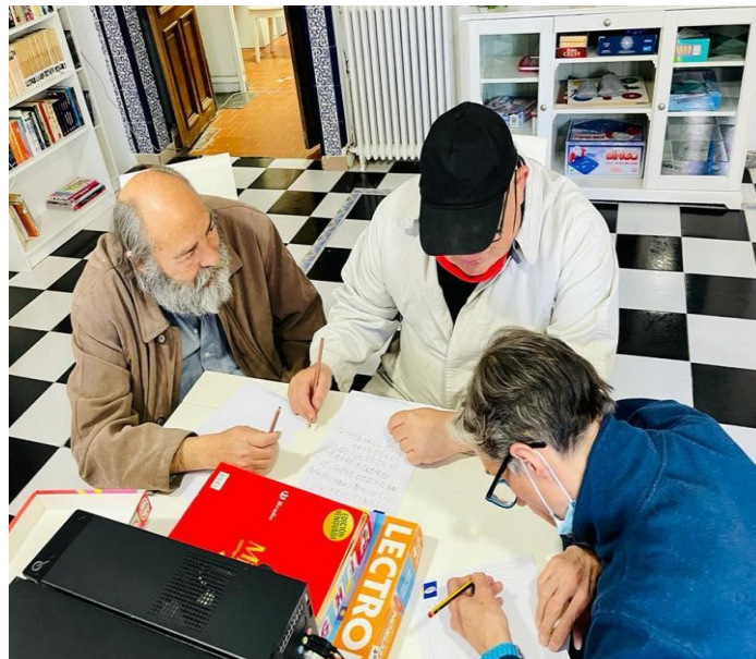
Opportunity Home for the Elder