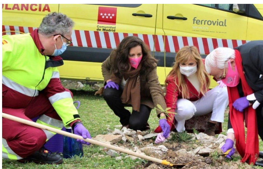
Event celebrating the signing of a partnership with Fundación Arca de Noé .