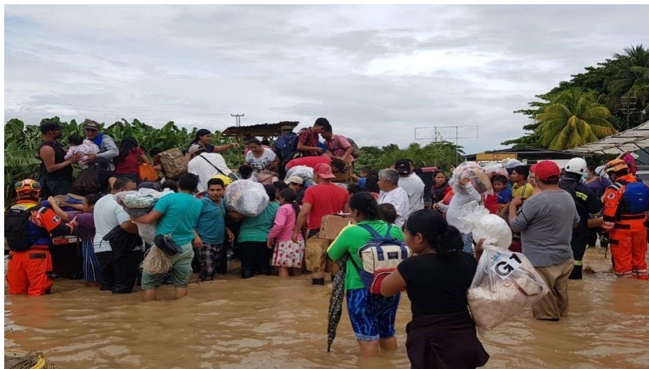
Emergency aid after the Iota and Eta hurricanes in Guatemala.