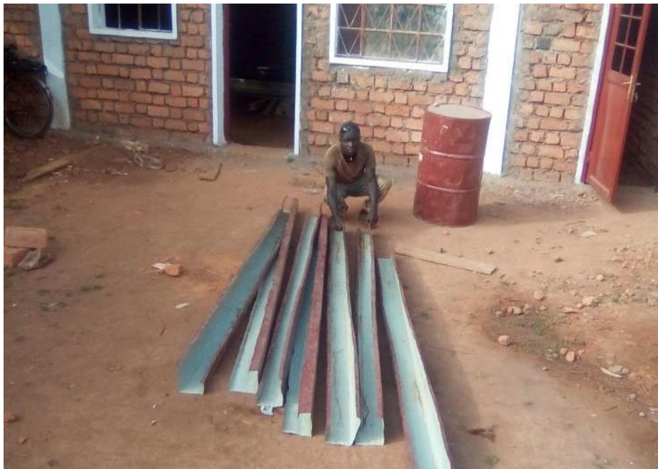
Rainwater harvesting Project in Burundi.