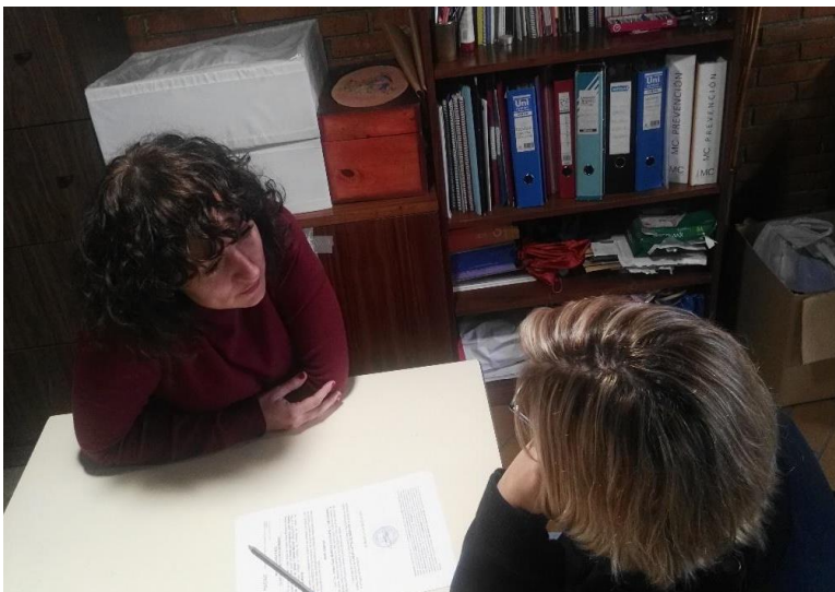
One of our emergency centers for gender-based violence victims in Spain.